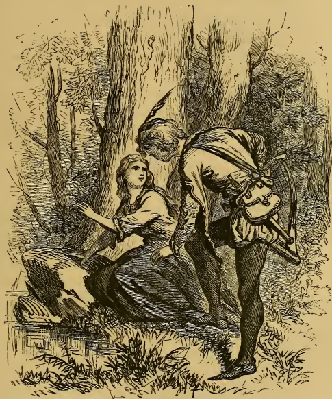
THE WEAVER'S DAUGHTER.